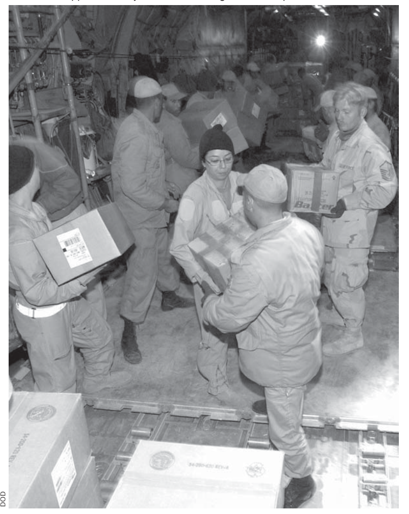
U.S. Air Force C-130 crewmembers and Iranian soldiers offload 20,000 pounds of medical supplies two days after a devasting 2003 earthquake in Iran.

and in late 1987 it banned most imports from Iran. The 1996 Iran-Libya Sanctions Act supplemented the ban on almost all bilateral trade, adding restrictions on foreign companies that invested in new Iranian oilfields worth more than $40 million.45 While the United States formally abjures economic warfare, its focused, unyielding economic-punishment policy can hardly be interpreted otherwise by Iranians. Sanctions against Iran have constituted a persistent economic hardship. 46 By actively blocking any economic aid for Iran, the United States implemented a sustained anti-Marshall Plan against a large Islamic country—a major regional state—situated astride the world's energy supplies.47 If sanctions were intended to "break the will of the enemy," change the Iranian regime, or cause it to renounce unwanted behavior, then sanctions have not worked. If sanctions were intended to keep Iran underperforming so it cannot create the capabilities to reduce U.S. security (that is, produce nuclear weapons), then according to the Bush Administration's own assessment, sanctions are not working.